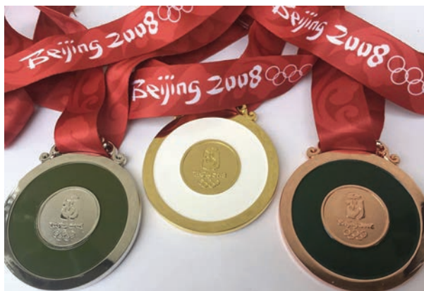
Beijing Olympics Medals