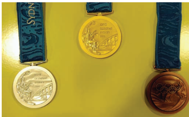
Sydney Olympics Medals