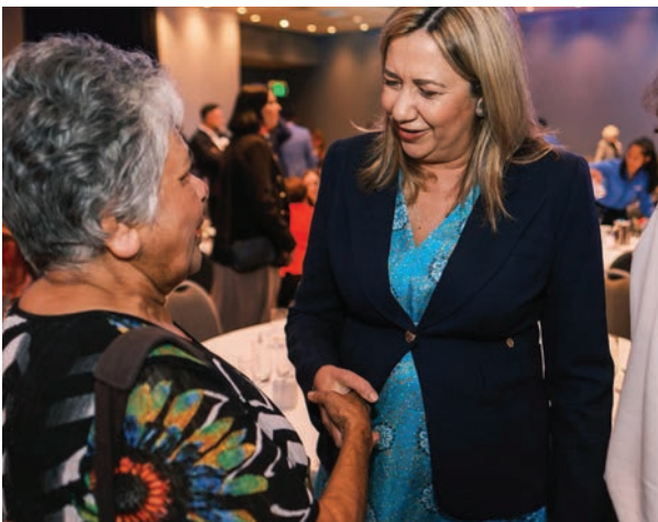
Premier Anastacia Palaszczuk MP wearing a dress from the Andrawilla Collection

More information: https://www.redridgethelabel.com.au/